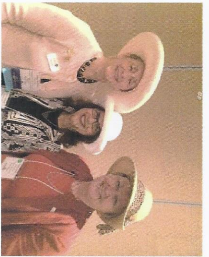
Stylishly representing FAB at a recent NYS convention.